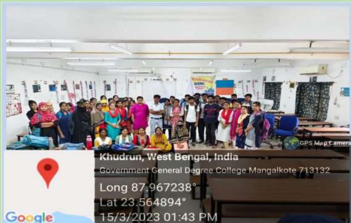
15.03.2023: Students of GGDCM with the speaker