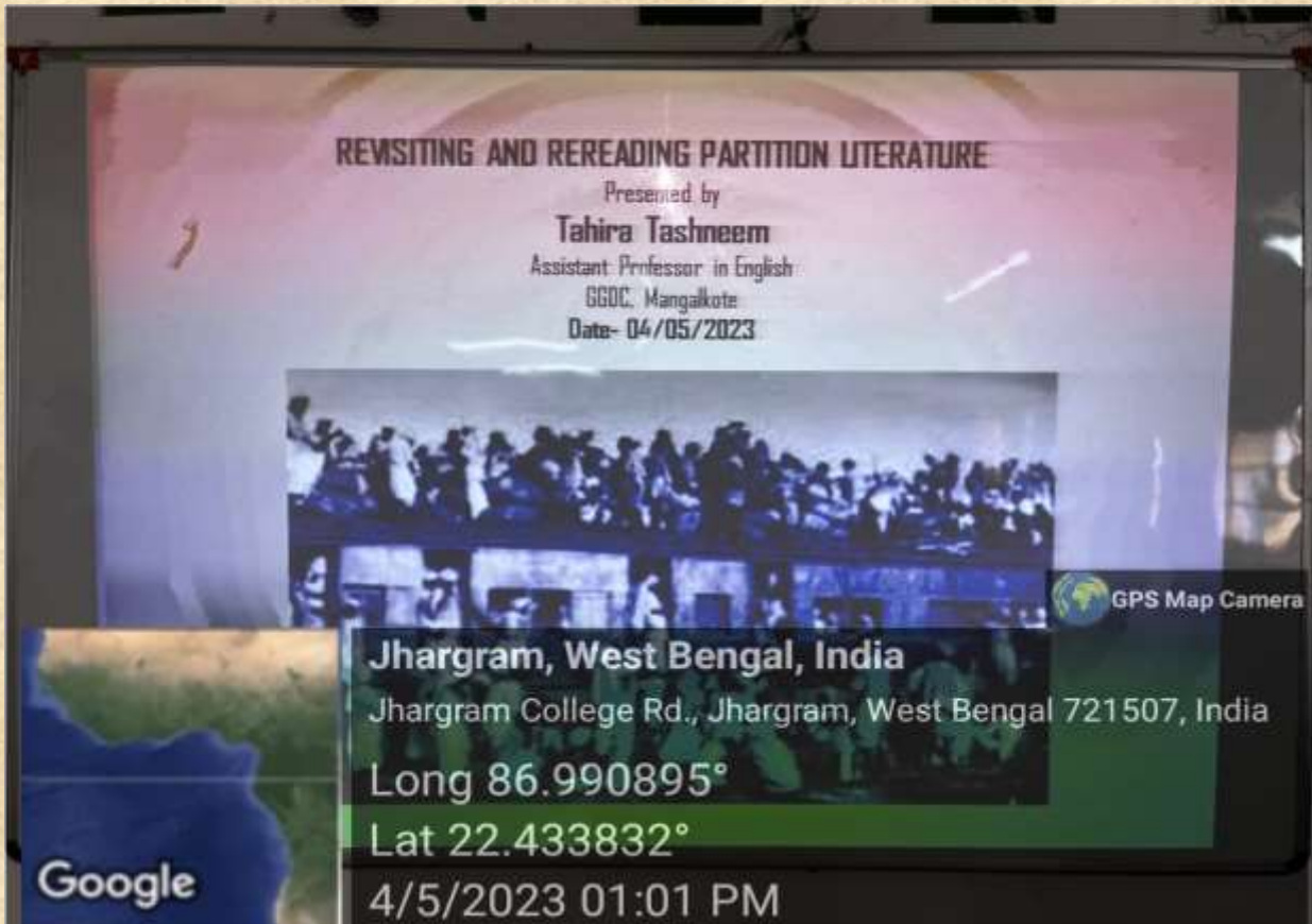
DATE- 04/05/2023: PIC. 1: PRESENTATION OF THE SPEAKER