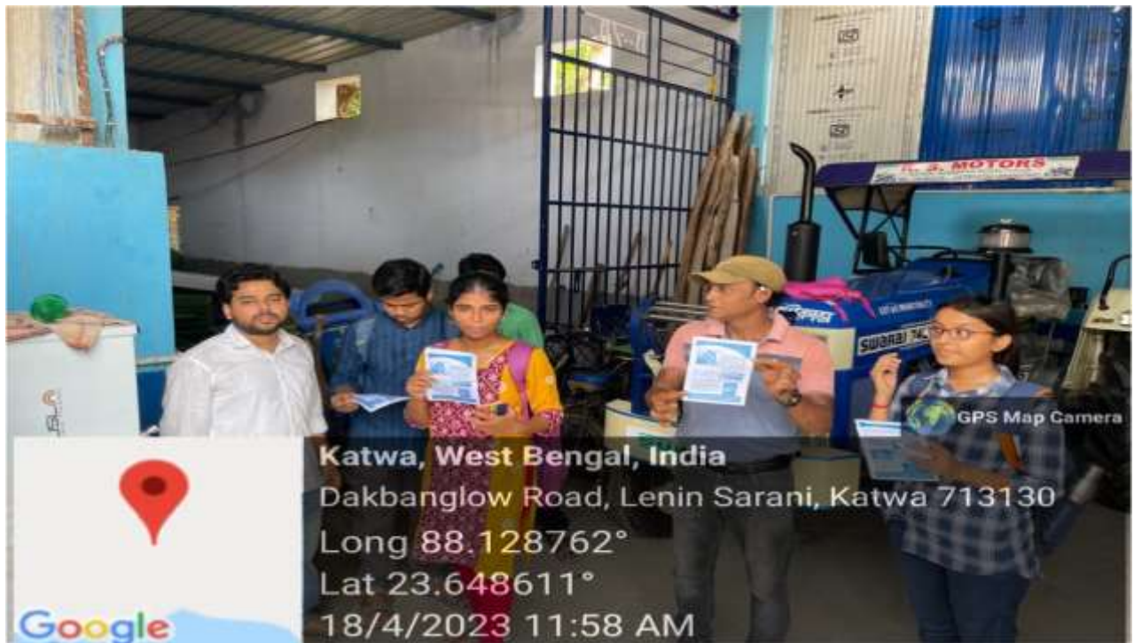
DATE- 18.04.2023: STUDENTS WITH FACULTY OF GGDC, MANGALKOTE AT KATWA MUNICIPALITY